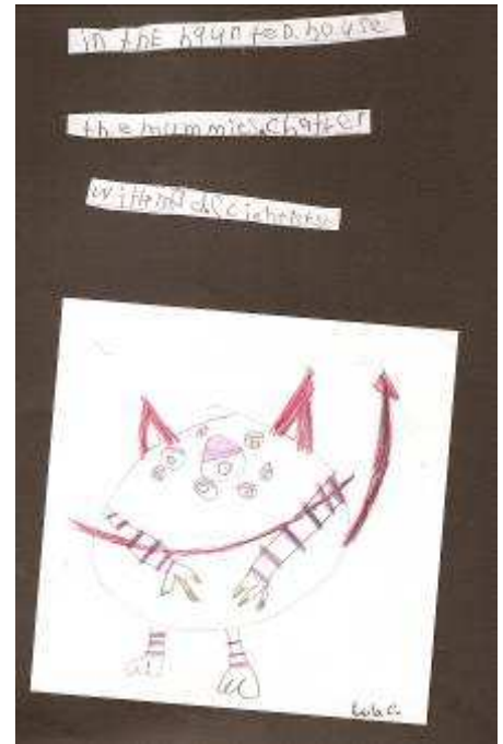
in the haunted house the mummies chatter with mad scientists —a haiku by Leila Clutter, age 5